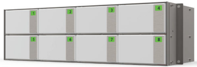
8BS: 8 S-size boxes with metal doors