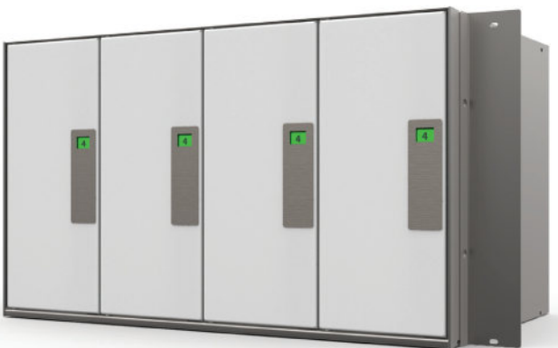
4BL: 4 x L size box, metal door