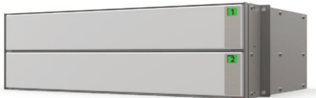
2B4S: 2 „4S“-size boxes, metal doors