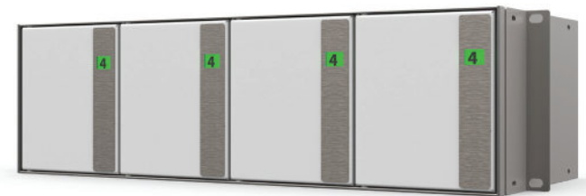
4BMT: 4 M-size boxes, metal door