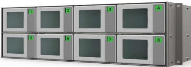
8BSG: 8 S-size boxes with security glass doors (with metal frame)