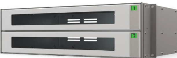
2B4SG: 2 „4S“-size boxes, glass doors