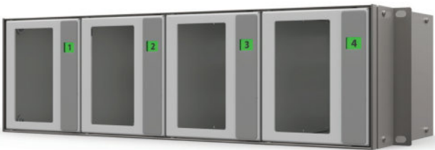
4BMG: 4 M-size boxes, glass door (with metal frame)