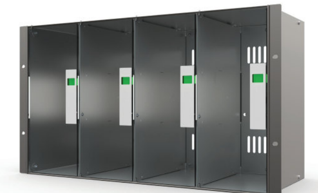
4BLP: 4 L-size boxes, plexiglass doors